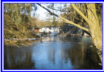
Derek & Beth's place at Birch Bay, WA