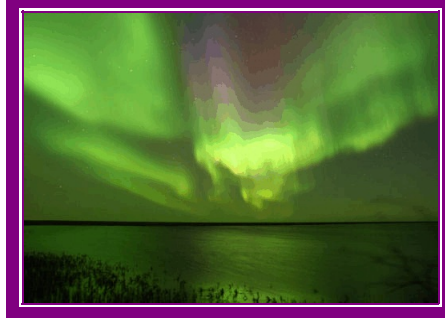
Aurora over lake at Helmericks