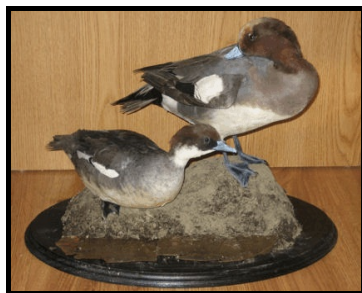
Bird Mount by Derek