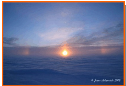
Sunrise On Colville