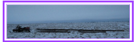
Towing two sleds for 40' pipe

wooded paradise outside of Fairbanks this past year. This