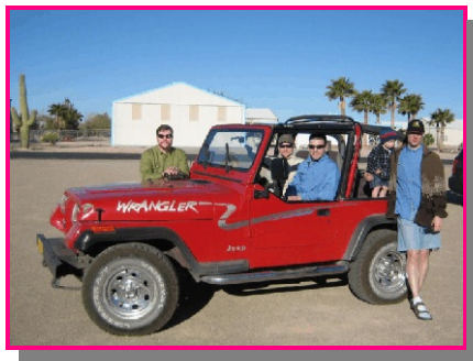
Ready for desert adventure 3-3-08