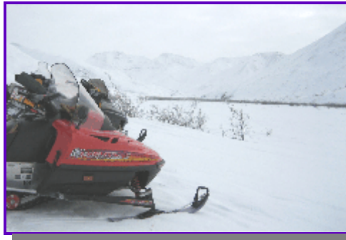
Mountains All Around