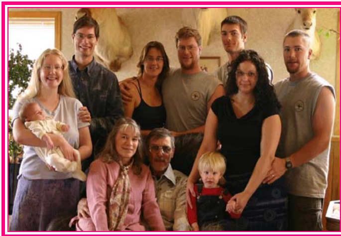
Family Aug. 2004

although the "Kids" have agreed to pitch in whenever energy, funds, or abilities are lacking from